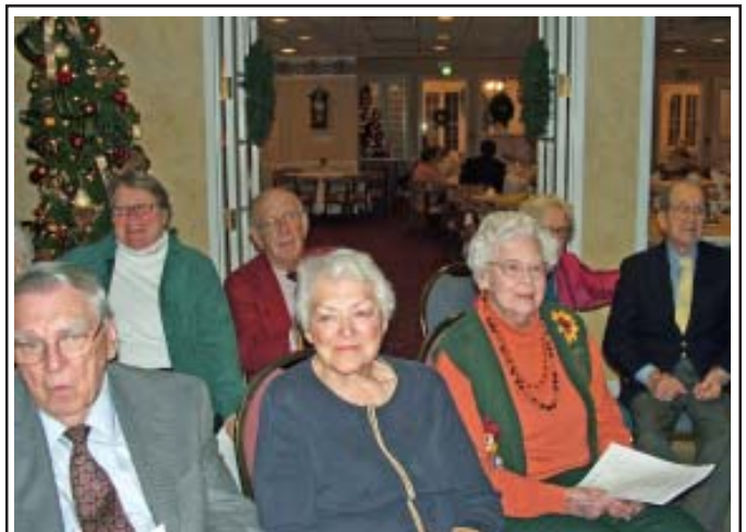
Residents and guests enjoying the stories and songs at the Lighting of the Greens.

The women of Meadowood look forward to the annual Women's Holiday Luncheon at Scholar's Inn on December 6. Guests are welcome to join us for this private party – the restaurant is closed for lunch service to the public. We will enjoy a delicious lunch, followed by a White Elephant gift exchange.