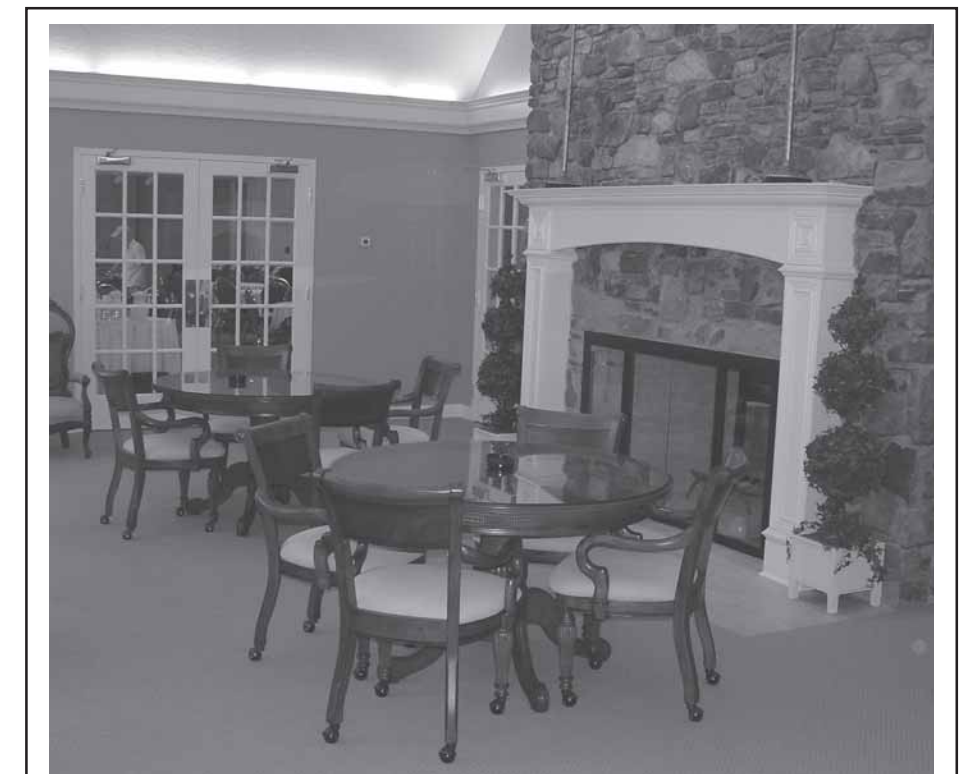
Interior view of the new Founders Room to be dedicated on Sept 15th