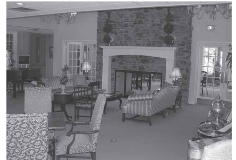
Above, the new library and Founder's Room as seen from the courtyard area. At right, the newly redecorated reception area and two views of the fireplace lounge. Below, the view that greets you as you enter Meadowood.