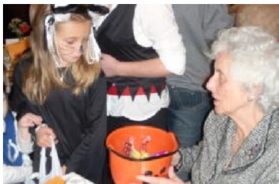
Children and grandchildren of employees could Trick or Treat during the resident Halloween Party.