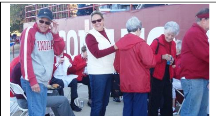
Great food and fun at the IU Homecoming Tailgate.