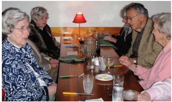
Both the food and the company were enjoyable at the Ethnic Food Outing to le Petit Café.