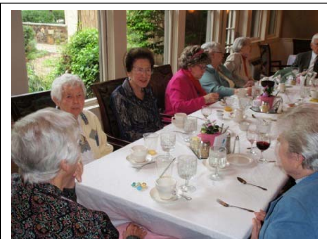
Good food and fellowship was in store for this table of friends in the Garden Room at Easter.

Forrest Gump (1994, 172 min). Entirely without trying, Forrest teaches Elvis Presley to dance, becomes a football star, meets John F. Kennedy, serves with honor in Vietnam, meets Lyndon Johnson, speaks at an anti-war rally at the Washington Monument, discovers the break-in at the Watergate, opens a profitable shrimping business, and much more as he goes about living his simple life. This is definitely an uplifting film full of patriot-