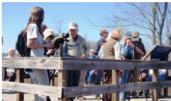
Pictured on the hike to Bean Blossom Bottoms on a lovely day.