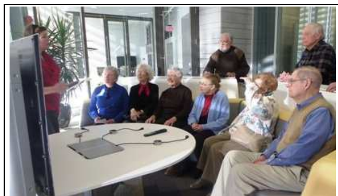
Learning more about the Cyberinfrastructure Bldg.

All men of Meadowood are invited to this monthly gathering of drinks and conversation.