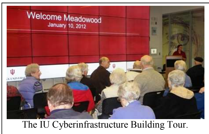
The IU Cyberinfrastructure Building Tour.