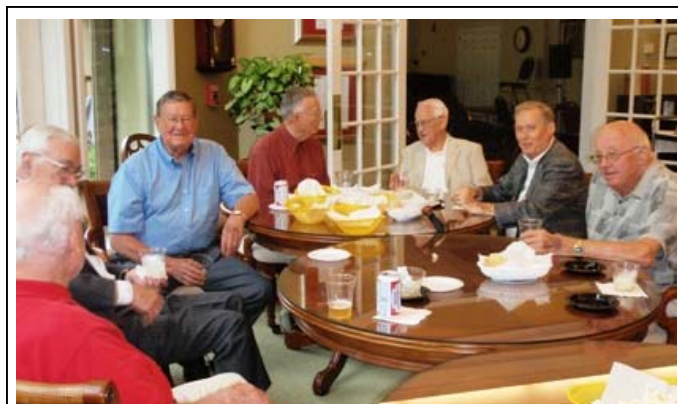
A few of the men of Meadowood at their monthly Just Men Hour in the Founders Room.

All residents are invited to attend this monthly meeting. Continental breakfast is served.