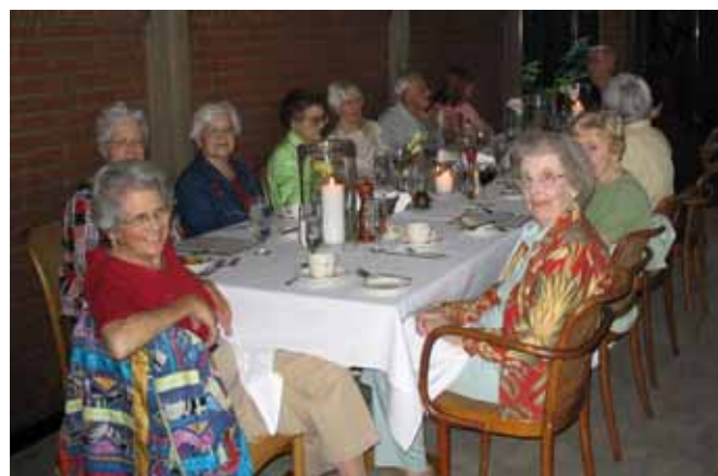
Anticipating the delicious food at the Red Geranium Restaurant -- it was worth the wait!