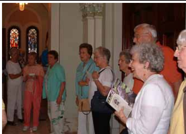
Standing in the Narthex of the Monastery in Ferdinand during the tour.