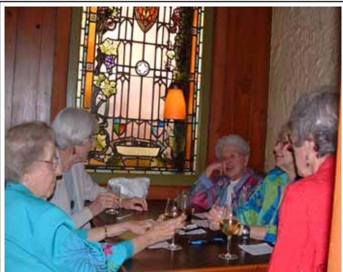
Enjoying the beautiful stained glass window and a cocktail at Chanteclair, the Fun Spot for August.