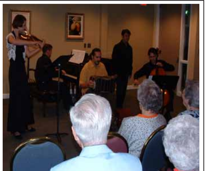
Residents and guests enjoyed excerpts from the operita, ‘Maria de Buenos Aires.’