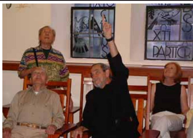
Looking up at a mural painted on the ceiling in the meeting room at St. Meinrad Archabby.