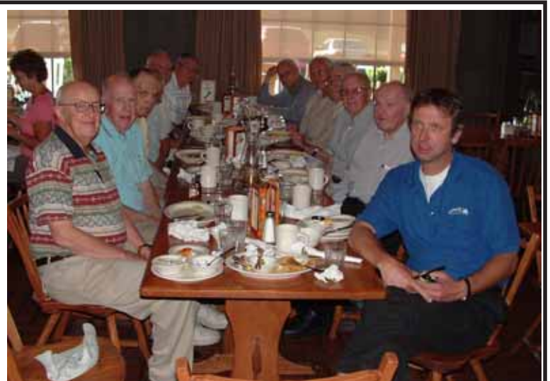
The men of Meadowood enjoying the Men's Breakfast at Cracker Barrel in August.

Calling all men of Meadowood for this popular monthly breakfast. Enjoy the down-home cooking featured at the Abe Martin Lodge. You won't leave hungry.