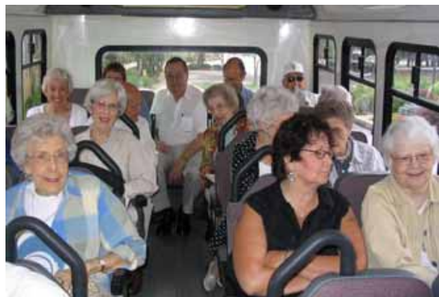
Here we go a'traveling - Meadowood style!