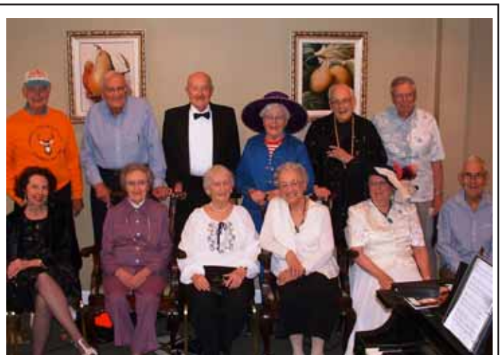
Members of the 2006 Meadowood Follies pose. We don't know who had more fun - the performers or the audience!

The Resident Council appoints the Music Committee, which is responsible for all in-house music programs. Recitals are arranged for Tuesday evenings in the Terrace Room, under the direction of