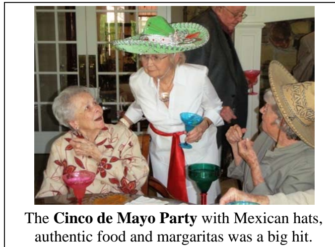
The Cinco de Mayo Party with Mexican hats, authentic food and margaritas was a big hit.

Recipient of the Owl Studios Emerging Jazz Artist Project, this is a free concert.