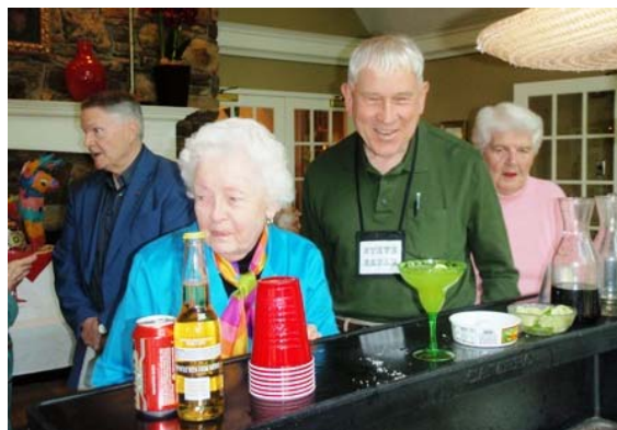
Lining up for Margaritas and Mexican beer at the Cinco de Mayo Party.