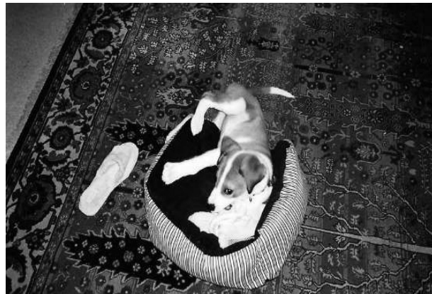
Bennie being busy